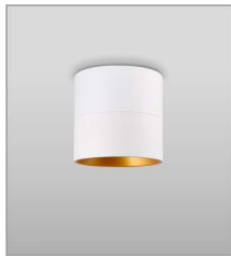
CM Surface ceiling mount to recessed J-box