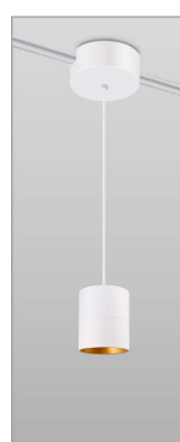
ACC24, ACC48, ACC96 Pendant cable mount to exposed J-box