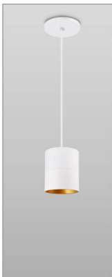
AC24, AC48, AC96 Pendant cable mount to recessed J-box