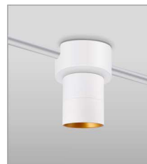
CMC Surface ceiling mount to exposed J-box