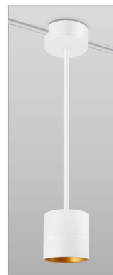
STC24, STC48, STC96 Pendant stem mount to exposed J-box