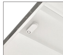
Lutron Vive Integral fixture control installation on RSHL-C

All dimensions are in inches (millimeters).