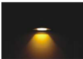
Forward Throw (FT)